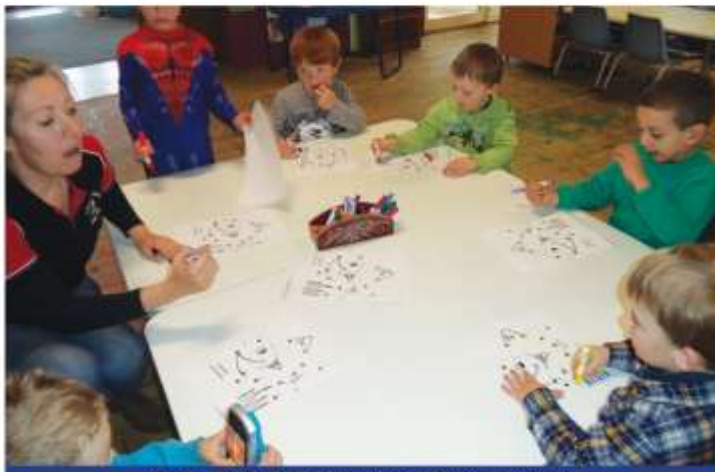
All the children are learning their numbers