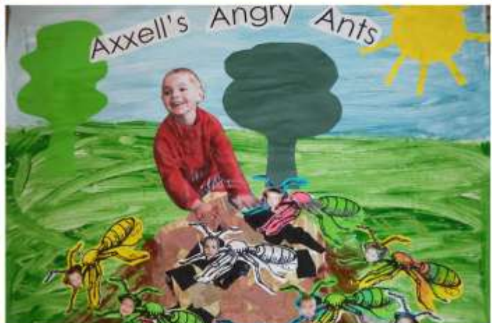
Axxell's Angry Ants