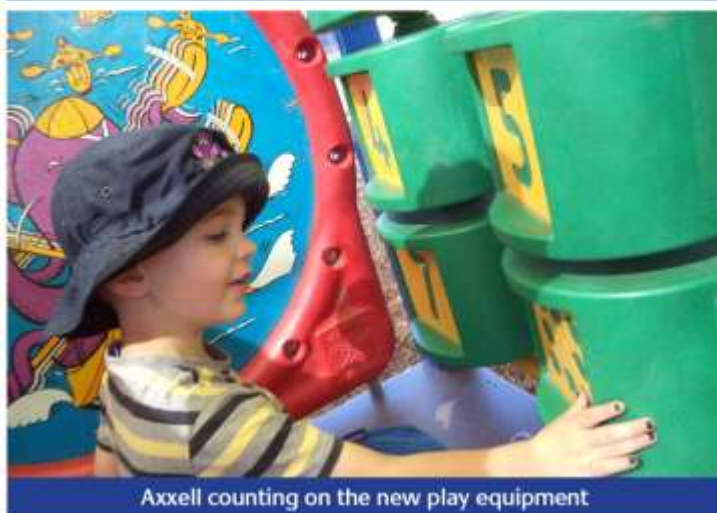
Axxell counting on the new play equipment