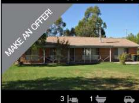
22-23 Evelyn Street EUGOWRA