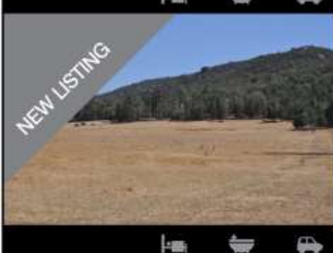
"Hillside" Escort Way EUGOWRA