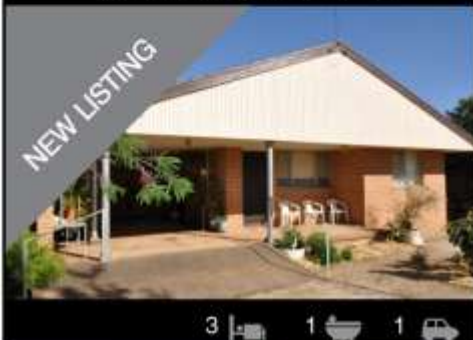
35 Nanima Street EUGOWRA

PROPERTIES NEEDED! PHONE MICHELLE FOR FREE, NO OBLIGATION APPRAISAL