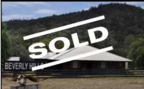
"Beverly Hills" EUGOWRA

CONTACT: MICHELLE CHENEY 51 NANIMA ST EUGOWRA NSW 2806 PHONE (BH) 6859 2231 (AH) 6859 2819 MOBILE: 0414 815 479