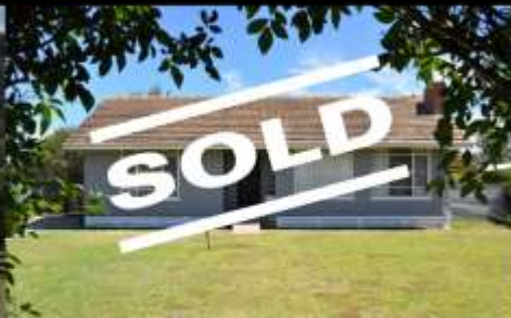
28 Pye Street EUGOWRA

PROPERTIES NEEDED! PHONE MICHELLE FOR FREE, NO OBLIGATION APPRAISAL