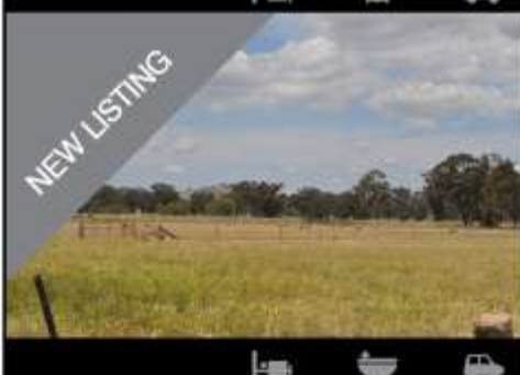
Loftus Street EUGOWRA