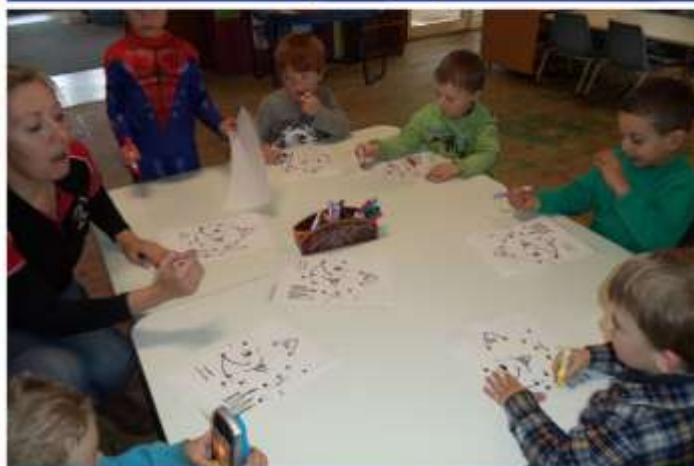
Learning our numbers