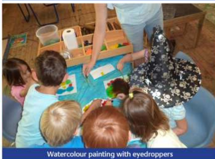
Watercolour painting with eyedroppers