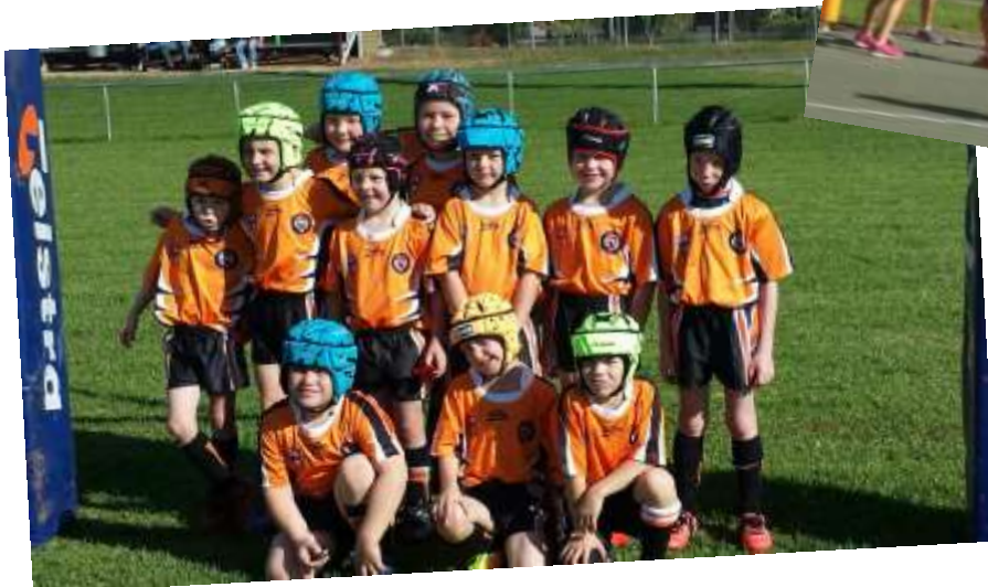
Under 8' Canowindra Tigers