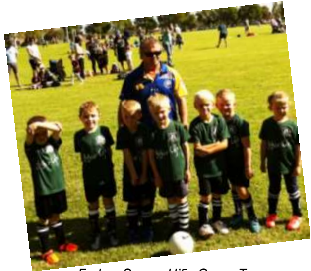
Forbes Soccer U'5s Green Team