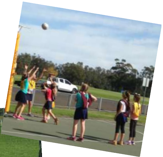
Forbes Koalas U'11s Netball