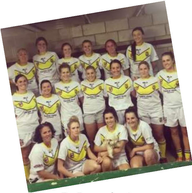
The Eugowra Geagles

With the winter months comes the winter sports. And sport is alive and 'kicking' for our young and young at heart. Here are some of our locals during their weekend sport. On the weekend of 23/24th the Geagles won 46 - 0 and the Eagles won 32 - 12 over Cargo. Under 19's had a bye. The little ones were at Soccer & Netball in Forbes and Footy in Canowindra. Love your sport!