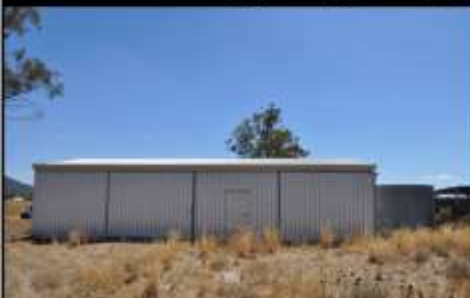
LOT 8 off Noble Street