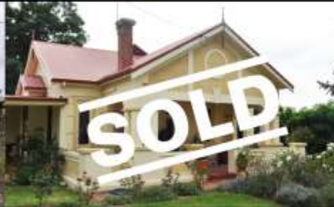
Pye Street EUGOWRA

PROPERTIES NEEDED! PHONE MICHELLE FOR FREE, NO OBLIGATION APPRAISAL