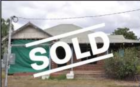
38 Oberon Street EUGOWRA

CONTACT: MICHELLE CHENEY 51 NANIMA ST EUGOWRA NSW 2806 PHONE (BH) 6859 2231 (AH) 6859 2819 MOBILE: 0414 815 479