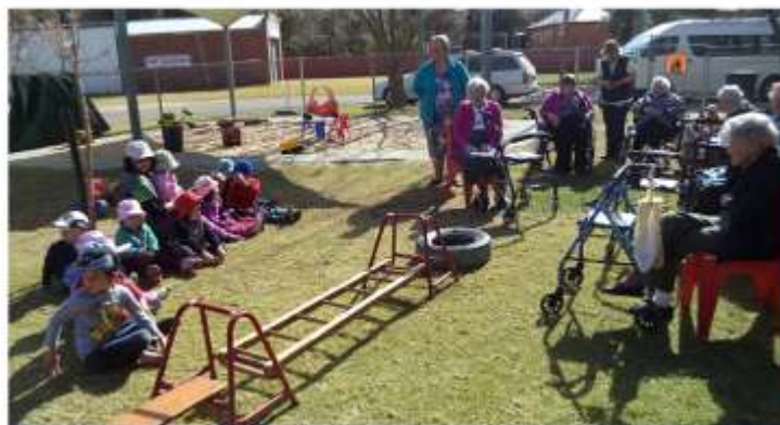
The children enjoy a visit from the Williwa Residents

Last month we made a mistake with our thank you's...the Lions Club was even more generous than the $500 we mentioned, it was in fact a very generous donation of $1000. Thank you so much for your support.