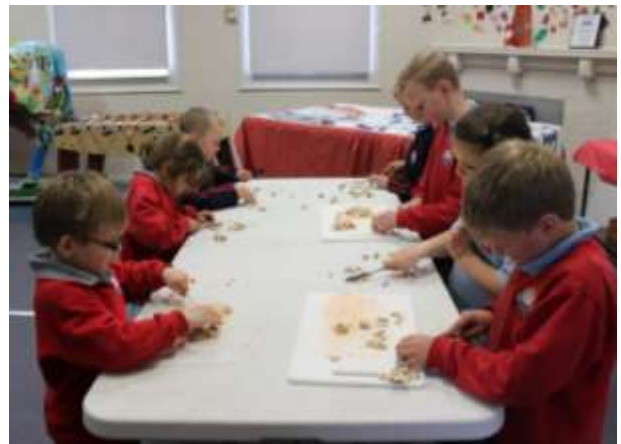
Cooking spaghetti bolognese

This year Eugowra Public School students will be putting on our bi-annual performance. "Pirates v's Mermaids" will be performed later in the year. Auditions are complete and rehearsals have commenced. Stay tuned for the performance dates.